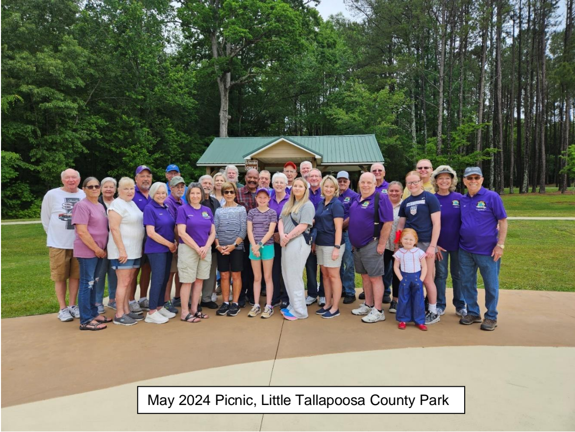
May 2024 Picnic, Little Tallapoosa County Park