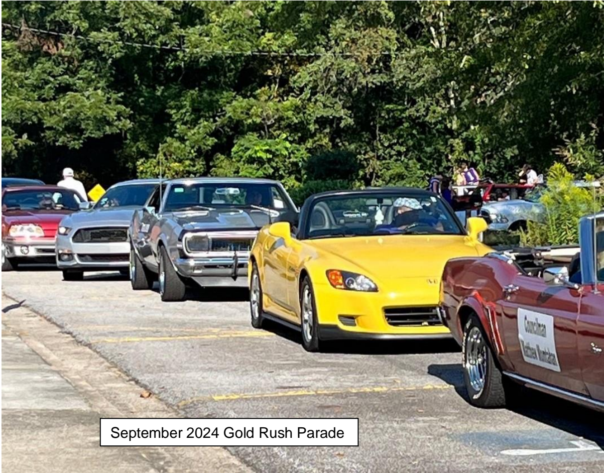
September 2024 Gold Rush Parade