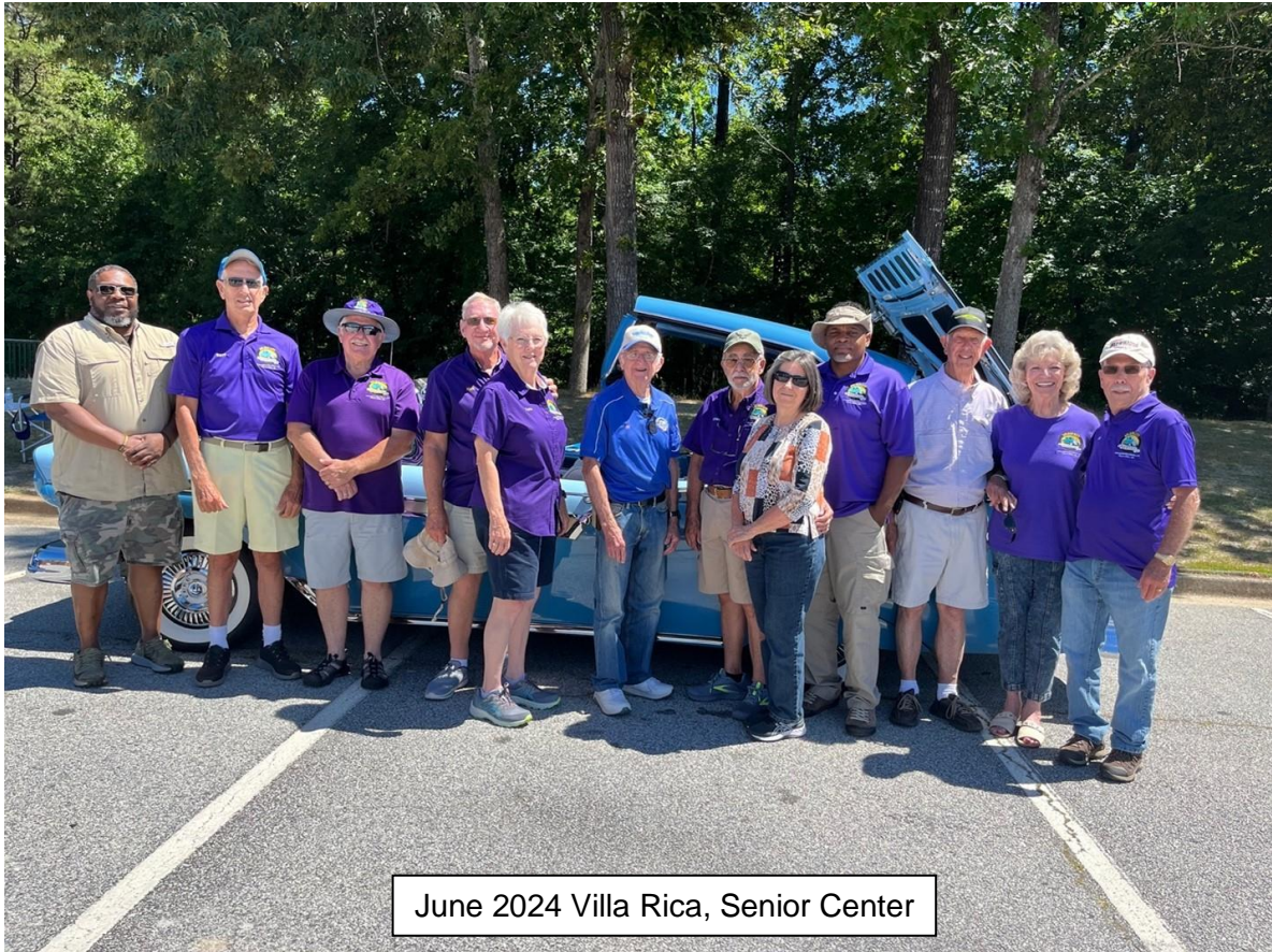
June 2024 Villa Rica, Senior Center