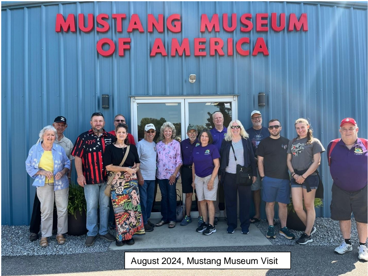
August 2024, Mustang Museum Visit