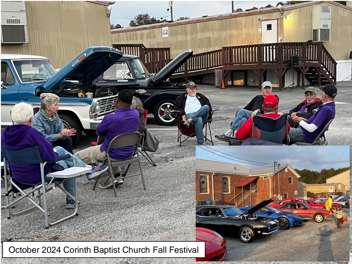
October 2024 Corinth Baptist Church Fall Festival